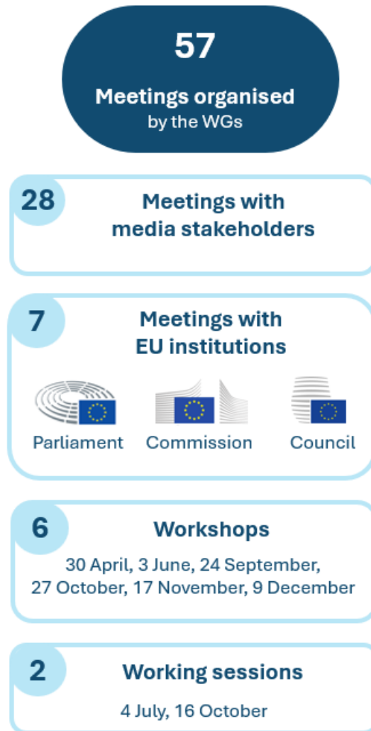
Figure 3: Workshops, working sessions and meeting with institutions and external stakeholders

Main categories shown; other meetings are included in the total.